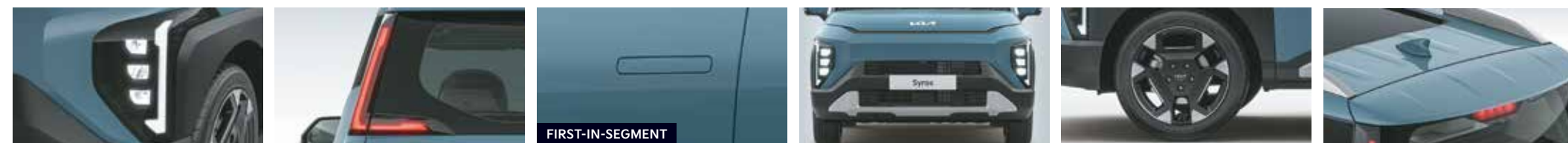
Ice Cube MFR LED Headlamps with Starmap LED DRLs