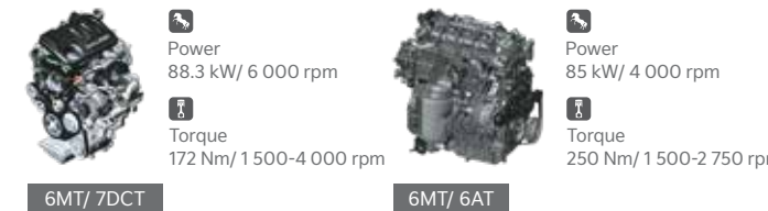
Smartstream G1.0 T-GDi