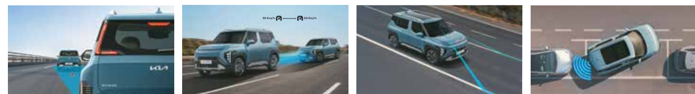
Forward Collision Warning and Avoidance Assist (FCW & FCA)