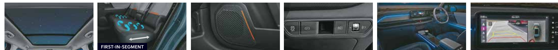
Dual Pane Panoramic Sunroof